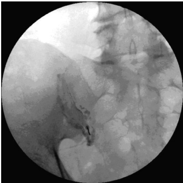
Figure 3. Intra-articular injection of sacroiliac joint with contrast in anterior-posterior view.