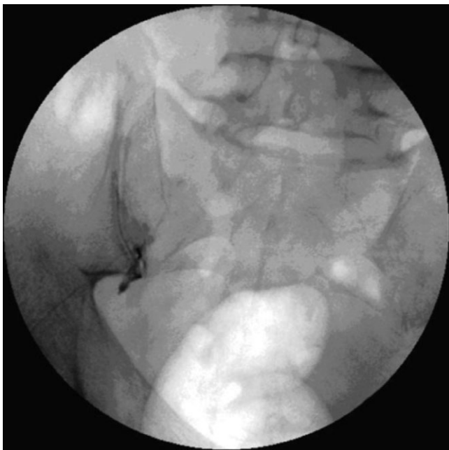
Figure 4. Intra-articular injection of sacroiliac joint with contrast in anterior-posterior view.